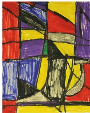
The Arcasin by Jackson Wingo Elementary