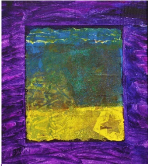
Tausible Fish Domain by Zane and Missi Selections from Side by Side